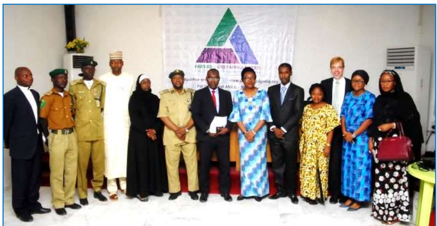
A cross section of participants at a PWAN Judicial Accountability event.