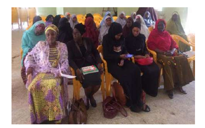
Staff and Stakeholders at the Islamic Center Hall, Unguwa Uku, Tarauni Local Government Area (31st July 2017)