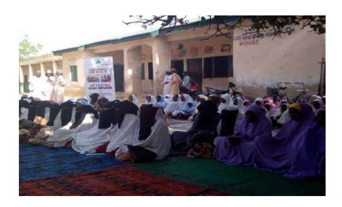
Ja En Special Primary School, Sharada Phase 3. The PDO paid a visit to the school, based on a request from its authorities (1st December 2017)