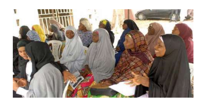
Awareness activity and Legal Clinic at the PDO premises (22nd June 2017)