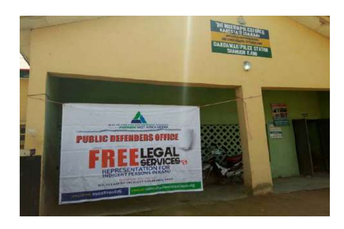
Awareness Activity at the Shahuci Police Station; a police division specifically designated to handle sexual violence cases (13th and 14th September 2017)