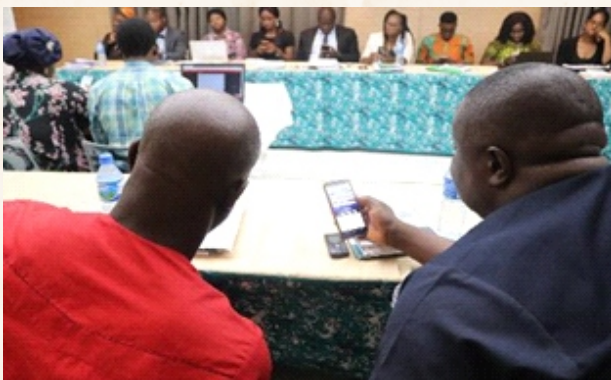
Participants viewing the app

The app is available on Android and IOS. Data inputted from the app will be used to support the project CMS.