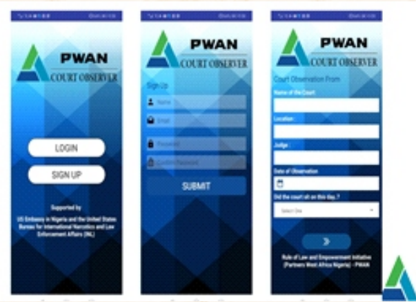
PWAN Court Observer App

The app will track daily court proceedings and particular time of court sitting, recess, and adjournments.