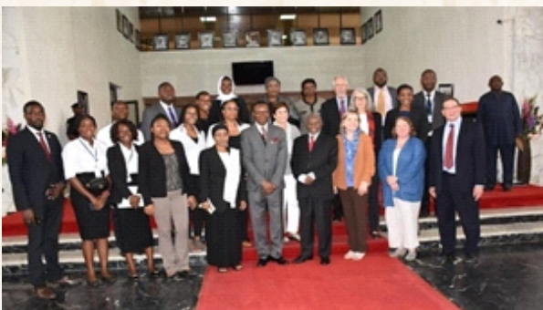
Interactive meeting with the Chief Justice of Nigeria; and at the Federal Ministry of Justice

The exchange visit was attended by a host of organizations and legal practitioners and justice sector actors Nigerian and US clinical educators, PartnersGlobal, PWAN, New-Rule, criminal law fellows, and NULAI Nigeria. The weeklong exchange visit emphasized learning from comparative examples, information, experience sharing, and relationship building.