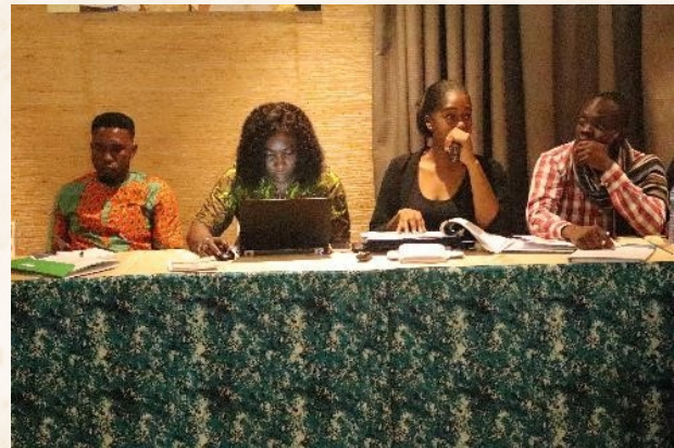
Cross section of participants at the KPCC meeting

The 3 rd Kuje Prison Coordination Committee (KPCC) meeting held on the 31 st of July 2019 in FCT, Abuja. In attendance were implementing partners and criminal justice actors involved in the Reform Kuje project.