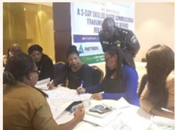
A breakout session during the training

PWAN organized a two-day skills-building communication training from the 26 th - 27 th June 2019 in Abuja. Attendees included public relations officers of the Nigerian Police Force (NPF), Nigerian Correction Service (NCS), National Agency for Prohibition of Trafficking in Persons (NAPTIP), Independent Corrupt Practices Commission (ICPC), Federal Ministry of Justice (FMOJ), Court Registrars, PWAN and NULAI Nigeria staff.